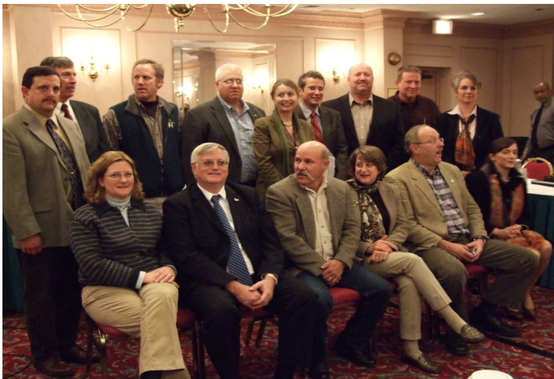
National Organic Standards Board Members